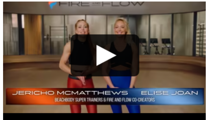
Fire and Flow