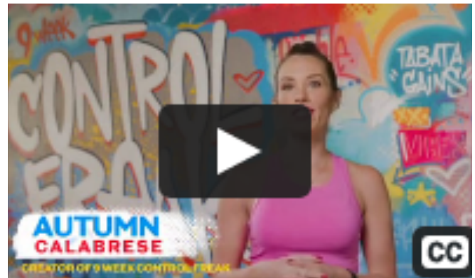
9 Week Control Freak