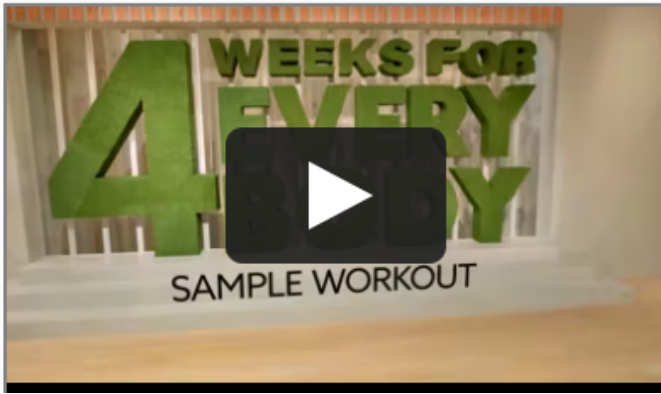
4 Weeks For Everybody

Let's workout! Press play and sample some workouts!